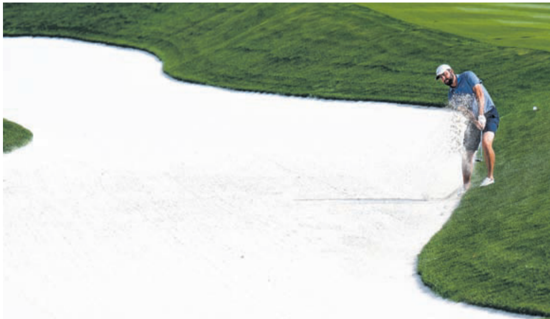
Scottie Scheffler hits from the bunker along the second fairway during a practice round for The Players Championship golf tournament Wednesday, March 13, 2024, in Ponte Vedra Beach, Fla.